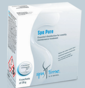
Spa Pure Box with 4 35 g sachets

This product can be used with all three care methods (chlorine, without chlorine using active oxygen or bromine).