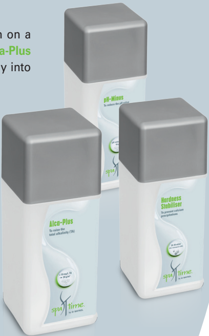
Alca-Plus pH-Minus Hardness Stabiliser

Check the TA level immediately after filling and then on a weekly basis. If necessary, raise the TA level with Alca-Plus or lower with pH-Minus . The product is dosed directly into the spa water.