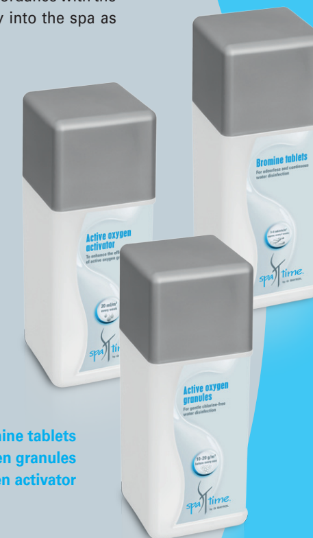
Bromine tablets Active oxygen granules Active oxygen activator

To increase the effectiveness of the granules, use them together with the Active oxygen activator .